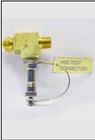
8169142 Street Tee (HSD Test Fitting)