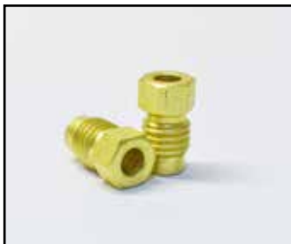
1080056 1/8" Terminal Nut (Used with all fittings)