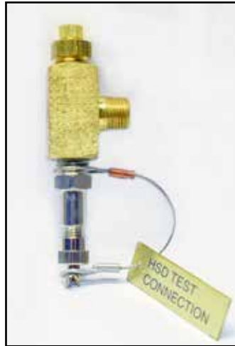
8169141 Male Branch Tee (HSD Test Fitting)