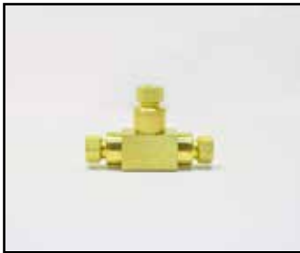
8084610 1/8" Tubing Tee with Terminal Nuts (Used between VCV and PRPV Manifold)

All fittings are inverted flare type. Inverted flare fittings meet the requirements of NAVSEA 03487-078-1000.