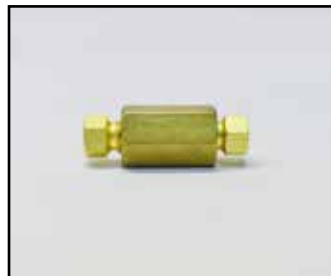
1080057 1/8" Tubing Coupling with Terminal Nut (Used to make emergency tube splices)