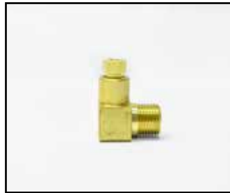
8084624 1/8" NTP x 1/8" Tubing 90° Ell with Terminal Nut (Used on HSD)