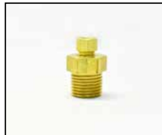
8084623 1/8" NTP x 1/8" Tubing Connector with Terminal Nut (Used on HSD and VCV)