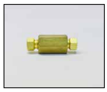
1/8" Tubing Coupling with Terminal Nut (Used to make emergency tube splices)