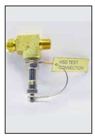
8169142 Street Tee (HSD Test Fitting)