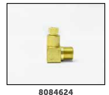
1/8" NTP x 1/8" Tubing 90° Ell with Terminal Nut (Used on HSD)