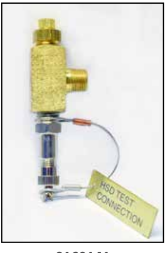
8169141 Male Branch Tee (HSD Test Fitting)