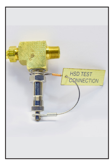
8169142 Street Tee (HSD Test Fitting)