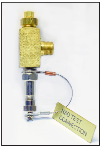
8169141 Male Branch Tee (HSD Test Fitting)