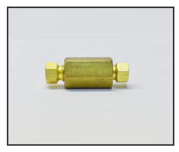
1/8" Tubing Coupling with Terminal Nut (Used to make emergency tube splices)