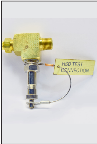
8169142 Street Tee (HSD Test Fitting)