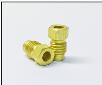
1080056 1/8" Terminal Nut (Used with all fittings)