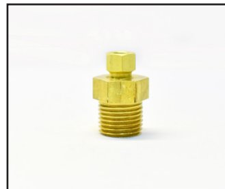
8084623 1/8" NTP x 1/8" Tubing Connector with Terminal Nut (Used on HSD and VCV)