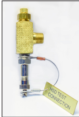
8169141 Male Branch Tee (HSD Test Fitting)