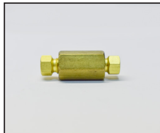
1080057 1/8" Tubing Coupling with Terminal Nut (Used to make emergency tube splices)