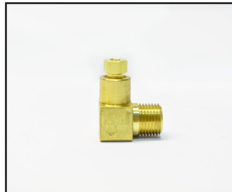
8084624 1/8" NTP x 1/8" Tubing 90° Ell with Terminal Nut (Used on HSD)