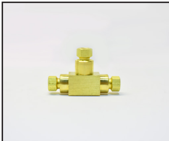
8084610 1/8" Tubing Tee with Terminal Nuts (Used between VCV and PRPV Manifold)

All fittings are inverted flare type. Inverted flare fittings meet the requirements of NAVSEA 03487-078-1000.