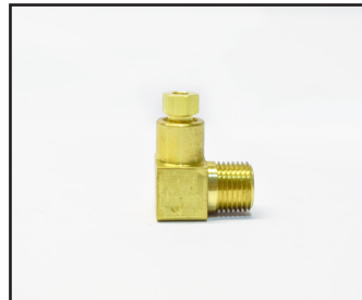
8084624 1/8" NTP x 1/8" Tubing 90° Ell with Terminal Nut (Used on HSD)