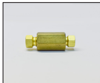
1080057 1/8" Tubing Coupling (shown with 1/8" Terminal Nut – sold separately) (Used to make emergency tube splices)