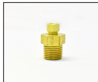
8084623 1/8" NTP x 1/8" Tubing Connector with Terminal Nut (Used on HSD and VCV)