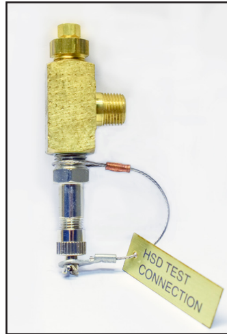
8169141 Male Branch Tee (HSD Test Fitting)