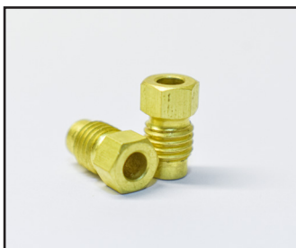
1080056 1/8" Terminal Nut (Used with all fittings)